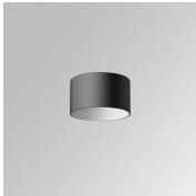
Product code: S8BE86B