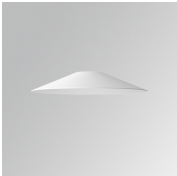
Product code: S8BE363W