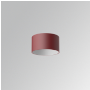
Product code: S8BE86B1