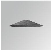
Product code: S8BE363PT