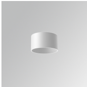
Product code: S8BE86W