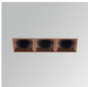
Product code: ODRF3C