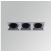
Product code: ODRF3M