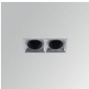
Product code: ODRF2M