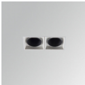
Product code: ODRF2W