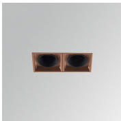
Product code: ODRF2C