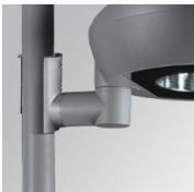
Product code: NIPOBR135G