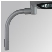
Product code: NIAR650G