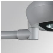
Product code: NIPOBR48G NIPOBR60G