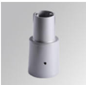
Product code: NIPOAD76G