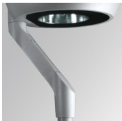
Product code: NIARED60G