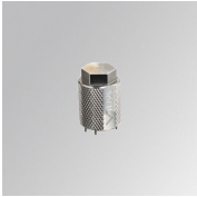
Product code: MP-011