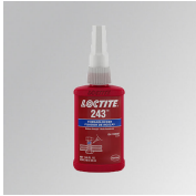
Product code: MP-004