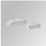
Product code: MPPSU001D-SELV