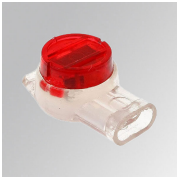
Product code: MP-003