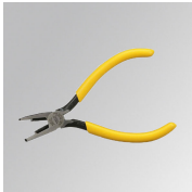
Product code: MP-002