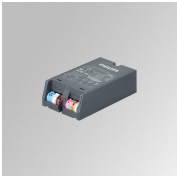
Product code: MPXTPSU002A500-D