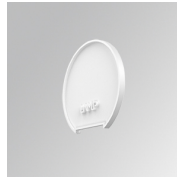
Product code: L6SUECW