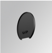
Product code: L6SUECB