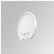
Product code: L6SUECW