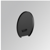
Product code: L6SUECB