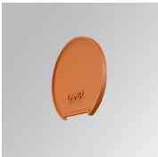
Product code: L6SUECW4