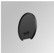
Product code: L6SUECB