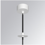
Product code: K71SUCAWI2000DWH K71SUCAWI2000NWH