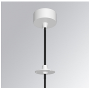
Product code: K71SUCAWI2000DWH K71SUCAWI2000NWH