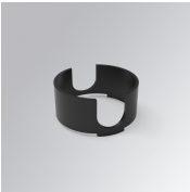
Product code: K71SUADLATBK