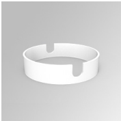
Product code: K21SUADLATWH