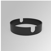
Product code: K21SUADLATBK