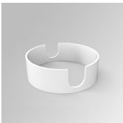
Product code: K11SUADLATWH