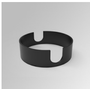
Product code: K11SUADLATBK