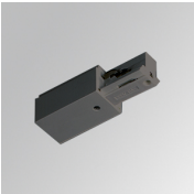
Product code: TKAARDNG