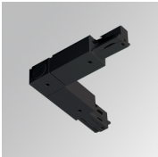
Product code: TKALODNB

Description: TRACK ACC INT 90° CORNER DALI/ONOFF WH