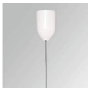
Product code: TKAWI3000W

Description: TRACK ACC. STEEL CABLE 3M BK.