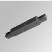
Product code: TKAAIDNG