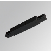
Product code: TKAAIDNB