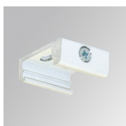
Product code: TKASRSUW