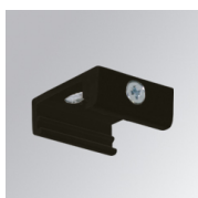
Product code: TKASRSUB