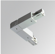
Product code: TKALODNW

Description: TRACK ACC EXT 90° CORNER DALI/ONOFF GR