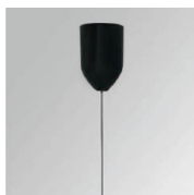
Product code: TKAWI3000B

Description: TRACK ACC. SUSP SUPPORT WH.