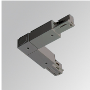
Product code: TKALODNG

Description: TRACK ACC EXT 90° CORNER DALI/ONOFF BK