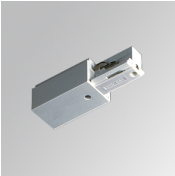
Product code: TKAARDNW