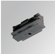
Product code: TKAJUDNG

Description: TRACK ACC SRT W/O SP JOINT DALI/ONOFF GR