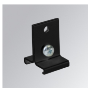
Product code: TKASUSSUG

Description: TRACK ACC. SUSP SUPPORT GR.