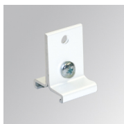
Product code: TKASUSSUW

Description: TRACK ACC. SUSP SUPPORT WH.