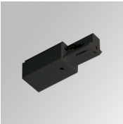
Product code: TKAARDNB