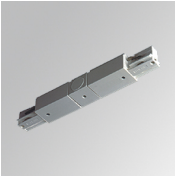
Product code: TKAAIDNW