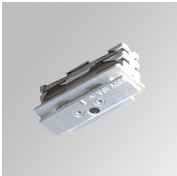
Product code: TKAJUDNW

Description: TRACK ACC SRT W/O SP JOINT DALI/ONOFF GR