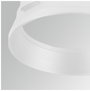
Product code: HS2RI90W