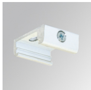
Product code: TKASRSUW