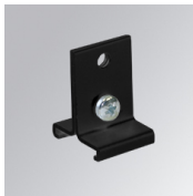
Product code: TKASUSUG

Description: TRACK ACC. SUSP SUPPORT GR.