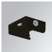
Product code: TKASRSUB