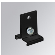
Product code: TKASUSUG

Description: TRACK ACC. SUSP SUPPORT GR.