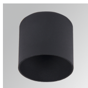
Product code: HSCU50

Description: HANCE 1000/2000 ACC. CUTTING BEAM