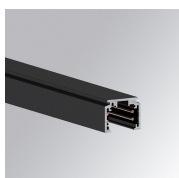
Product code: TLSUPR1000DNB TLSUPR2000DNB

Description: TRACK 48V ACC. X JOINT DALI/ONOFF WH.