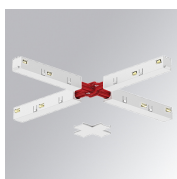
Product code: TLASUXJDNW

Description: TRACK 48V ACC. X JOINT DALI/ONOFF BK.