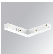
Product code: TLASULDNW

Description: TRACK 48V ACC. 90° CORNER DALI/ONOFF BK.