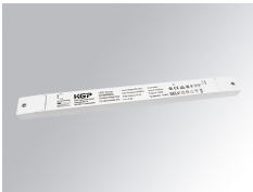
Product code: TLDRV2015048N

Description: DRIVER 100W 48V 220-240V NR IND LIN