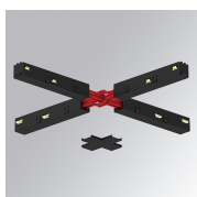
Product code: TLASUXJDNB

Description: SUSPENSION CABLE TRACK 48V 1500MM WH SUSPENSION CABLE TRACK 48V 3000MM WH