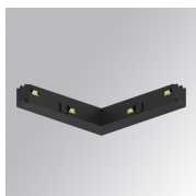
Product code: TLASULDNB

Description: TRACK 48V ACC. 90° CORNER DALI/ONOFF BK.