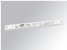
Product code: TLDRV2010048N

Description: HANCE 1000/2000 ACC. SOFT LENS