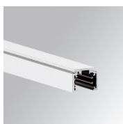
Product code: TLSUPR1000DNW TLSUPR2000DNW

Description: TRACK 48V DALI/ONOFF 1M BK. TRACK 48V DALI/ONOFF 2M BK.