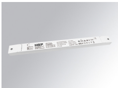
Product code: TLDRV2010048N