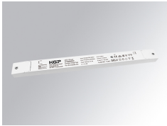
Product code: TLDRV2010048N