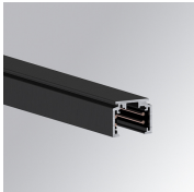
Product code: TLSUPR1000DNB TLSUPR2000DNB

Description: TRACK 48V ACC. X JOINT DALI/ONOFF WH.