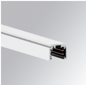
Product code: TLSUPR1000DNW TLSUPR2000DNW

Description: TRACK 48V DALI/ONOFF 1M BK. TRACK 48V DALI/ONOFF 2M BK.