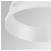
Product code: HSRI65W