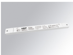
Product code: TLDRV2010048N