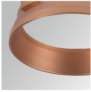
Product code: HSRI65C