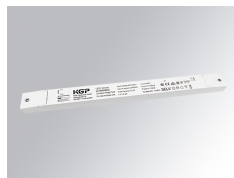
Product code: TLDRV2015048N