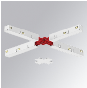
Product code: TLASUXJDNW

Description: TRACK 48V ACC. X JOINT DALI/ONOFF BK.