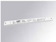
Product code: TLDRV2010048N

Description: HANCE 1000/2000 ACC. DIF TRANS