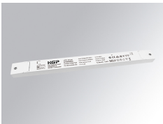
Product code: TLDRV2015048N

Description: DRIVER 100W 48V 220-240V NR IND LIN