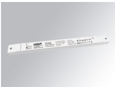
Product code: TLDRV2015048N Description: DRIVER 150W 48V 220-240V NR IND