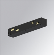
Product code: TLASUIJDNB