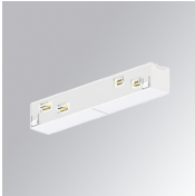
Product code: TLASUIJDW