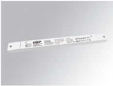
Product code: TLDRV2015048N Description: DRIVER 150W 48V 220-240V NR IND