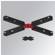
Product code: TLASUXJDNB

Description: SUSPENSION CABLE TRACK 48V 1500MM WH SUSPENSION CABLE TRACK 48V 3000MM WH