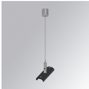
Product code: TLASUWI1500B TLASUWI3000B TLSUWI1500B

Description: TRACK 48V ACC. 90° CORNER DALI/ONOFF WH.