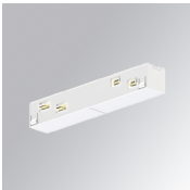
Product code: TLASUIJDW