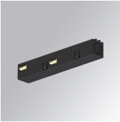
Product code: TLASUADNB