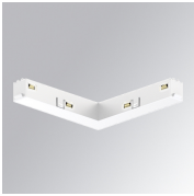
Product code: TLASULDNW

Description: TRACK 48V ACC. 90° CORNER DALI/ONOFF BK.