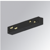
Product code: TLASUIJDNB