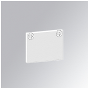
Product code: TLASUECW