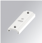
Product code: TLAMJW