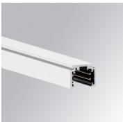
Product code: TLASUPR1000DNW TLASUPR2000DNW

Description: TRACK 48V DALI/ONOFF 1M BK. TRACK 48V DALI/ONOFF 2M BK.