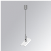
Product code: TLASUWI1500W TLASUWI3000W

Description: SUSPENSION CABLE TRACK 48V 1500MM BK SUSPENSION CABLE TRACK 48V 3000MM BK SUSPENSION CABLE TRACK 48V 1500MM BK