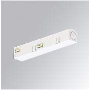
Product code: TLASUADNW