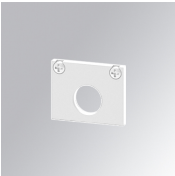
Product code: TLASUECCW