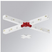
Product code: TLASUXJDNW

Description: TRACK 48V ACC. X JOINT DALI/ONOFF BK.