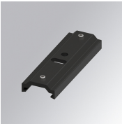
Product code: TLAMJB