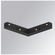
Product code: TLASULDNB

Description: TRACK 48V ACC. 90° CORNER DALI/ONOFF BK.