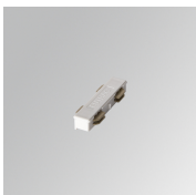
Product code: TLSUIJDW