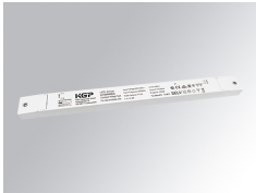
Product code: TLDRV2015048N