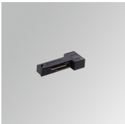
Product code: TLSUARDB