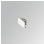
Product code: TLSUECW