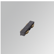
Product code: TLSUIJDB