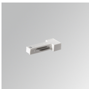
Product code: TLSUARDW