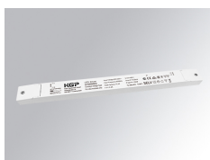
Product code: TLDRV2015048N

Description: DRIVER 100W 48V 220-240V NR IND LIN