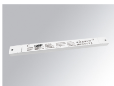
Product code: TLDRV2010048N

Description: DRIVER 100W 48V 220-240V NR IND LIN