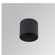
Product code: HSCU25

Description: HANCE 500 ACC. CUTTING BEAM