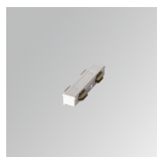
Product code: TLSUIJDW