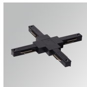
Product code: TLSUXJDB

Description: SUSPENSION CABLE TRACK 48V NK.