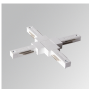
Product code: TLSUXJDW

Description: TRACK 48V ACC. X JOINT DALI BK.