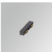
Product code: TLSUIJDB