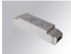
Product code: TLDRV207048N