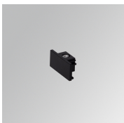
Product code: TLSUECB