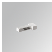
Product code: TLSUARDW