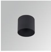
Product code: HSCU25

Description: HANCE 500 ACC. CUTTING BEAM