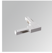
Product code: TLSULIDW

Description: TRACK 48V ACC. IN 90° CORNER DALI BK.