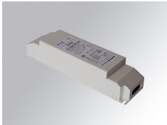
Product code: TLDRV2015048N