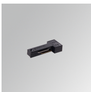
Product code: TLSUARDB