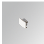
Product code: TLSUECW