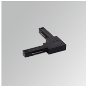
Product code: TLSULODB

Description: TRACK 48V ACC. IN 90° CORNER DALI WH.