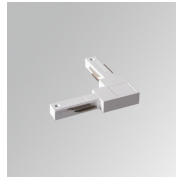
Product code: TLSULODW

Description: TRACK 48V ACC. OUT 90° CORNER DALI BK.