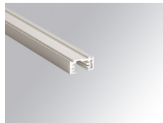
Product code: TLSUPR1000DW TLSUPR2000DW

Description: TRACK 48V DALI 1M BK. TRACK 48V DALI 2M BK.