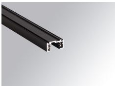
Product code: TLSUPR1000DB TLSUPR2000DB

Description: TRACK 48V ACC. OUT 90° CORNER DALI WH.