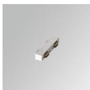
Product code: TLSUIJDW

Description: TRACK 48V ACC. INTM JOINT DALI BK.