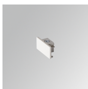
Product code: TLSUECW

Description: TRACK 48V ACC. END COVER BK.