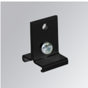
Product code: TKASUSSUG