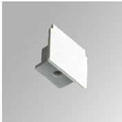
Product code: TKAECG