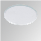
Product code: HSTR75