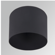
Product code: HSCU75