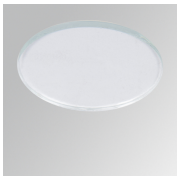
Product code: HSTR50 Description: HANCE 1000/2000 ACC. DIF TRANS