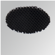
Product code: HSHO50 Description: HANCE 1000/2000 ACC. HONEYCOMB GRILLE