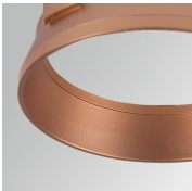
Product code: HSRI65C Description: HANCE 1000/2000 ACC. RING DECO CO.