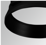
Product code: HSRI65B Description: HANCE 1000/2000 ACC. RING DECO BK.