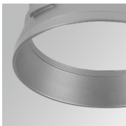
Product code: HSRI65M Description: HANCE 1000/2000 ACC. RING DECO MET.