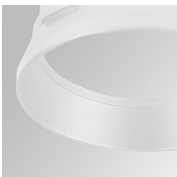
Product code: HSRI65W Description: HANCE 1000/2000 ACC. RING DECO WH.