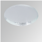
Product code: HSEL50 Description: HANCE 1000/2000 ACC. ELIPTICAL LENS