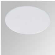
Product code: HSSL50 Description: HANCE 1000/2000 ACC. SOFT LENS