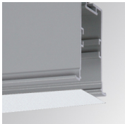
Product code: F5DIX/MMOP