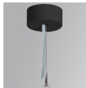
Product code: F4SUCAWI1000DB F4SUCAWI4000DB