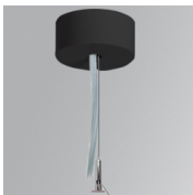
Product code: F4SUCAEMFA1000NB F4SUCAEMFA4000NB