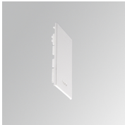
Product code: F4SUECW