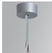
Product code: F4SUCAEMFA1000NG F4SUCAEMFA4000NG