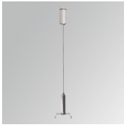
Product code: F4SUWIDE1000G