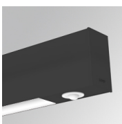
Product code: F41EMG3HDWB