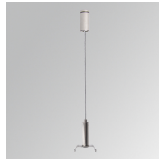
Product code: F4SUWIDE4000G