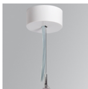
Product code: F4SUCAEMFA1000NW F4SUCAEMFA4000NW