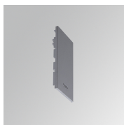
Product code: F4SUECG