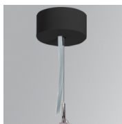
Product code: F4SUCAEMFA1000NB F4SUCAEMFA4000NB