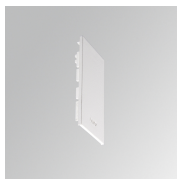
Product code: F4SUECW