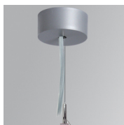
Product code: F4SUCAEMFA1000NG F4SUCAEMFA4000NG