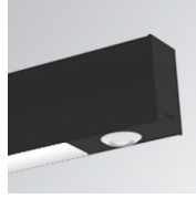
Product code: F41LIGHTSNDB