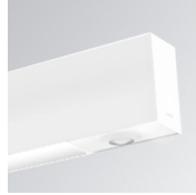
Product code: F41LIGHTSNDW