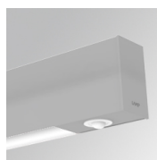
Product code: F41EMG3HDWG