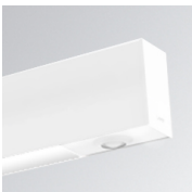
Product code: F41LIGHTSNDW