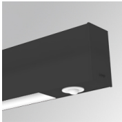
Product code: F41EMG3HDWB