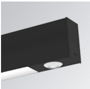
Product code: F41LIGHTSNDB