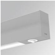
Product code: F41EMG3HDWG