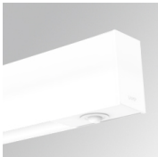
Product code: F41EMG3HDWW