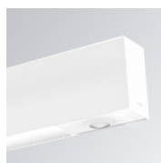
Product code: F41LIGHTSNDW