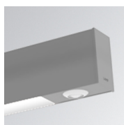
Product code: F41LIGHTSNDG