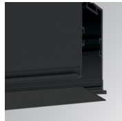
Product code: F4PRREX/MMB