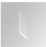
Product code: F4REECW