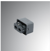
Product code: CT3P68G