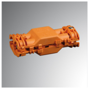
Product code: CT3P68O