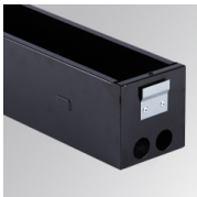
Product code: BZREBO2000