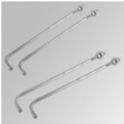
Product code: 9600973 Description: POLE ACC. M22 BOLT SET