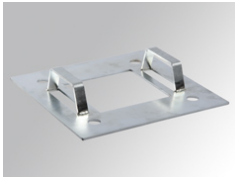
Product code: 9600913 Description: POLE ACC. 285MM FIXATION PATTERN