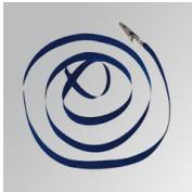
Product code: ELWRST Description: ACC. ELECTROSTATICS WRIST STRAP