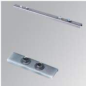
Product code: F7JO Description: ACC. INTM JOINT