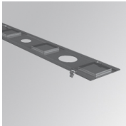
Product code: DIOPST1000 Description: ACC. DIF. SOFT TECH OPAL